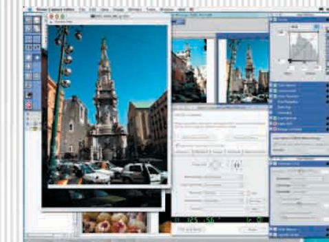
image files. Improvements to the new version include faster browsing, viewer and data transfer functions, and easier editing.

Versatile functions of the bundled Nikon View software simplify data transfer and browsing of