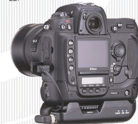
with Nikon Wireless Transmitter WT-1(option)

New to the Vibration Reduction Lens lineup is the AF-S VR Zoom-Nikkor 200-400mm f/4G IF-ED.