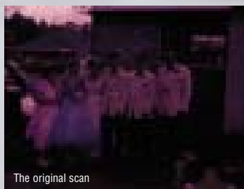
The original scan