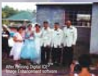
After running Digital ICE 3™ Image Enhancement software