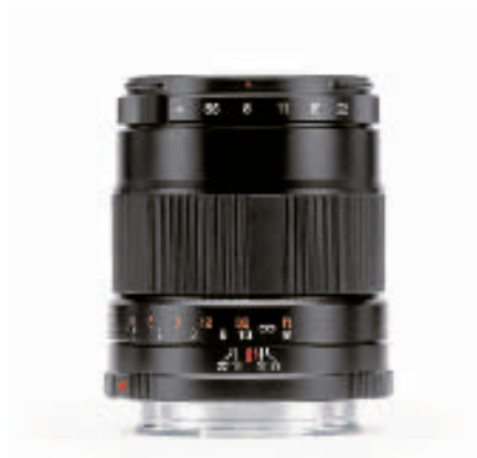
HASSELBLAD 4/90 MM 3024019

The dedicated 49 mm center filter is recommended for critical situations where transparency film is used. The center filter is normally not required when using negative film if the lens is stopped down to f/8 or smaller aperture.