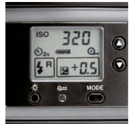
LCD EASY VIEWING OF CAMERA SETTINGS ON REAR DISPLAY