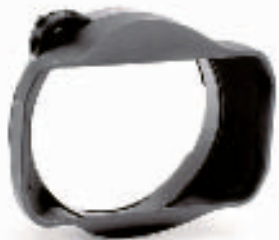
LENS SHADE XPan 45/90 MM 3054405