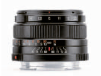
HASSELBLAD 4/45 MM 3024015

The very compact design and high image quality of the Hasselblad 4/45 mm make this lens the obvious choice as the standard XPan II camera lens. When used for panorama images the lens has a true wide-angle horizontal coverage of 71°.