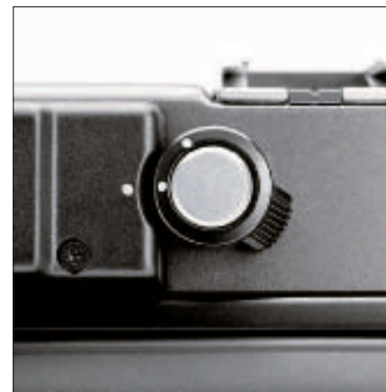
FORMAT CHOICE SWITCH FROM STANDARD 35 MM TO PANORAMA FORMAT AT THE FLIP OF A SWITCH.