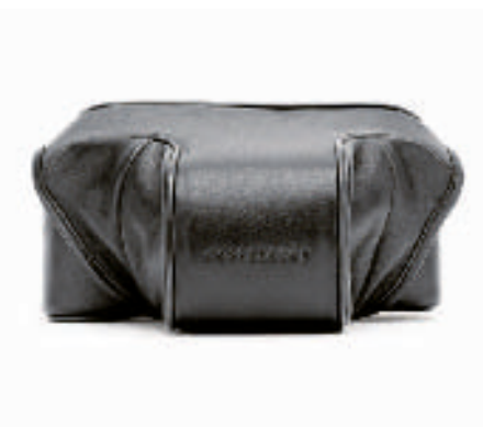
LEATHER CASE 580 3054468

The XPan II viewfinder can be customized to suit individual eyesight. The available diopter range of the correction eyepieces is wide enough to meet virtually all individual preferences. Correction eyepieces can be locked in place and are rubber coated to prevent damage to eyeglasses.