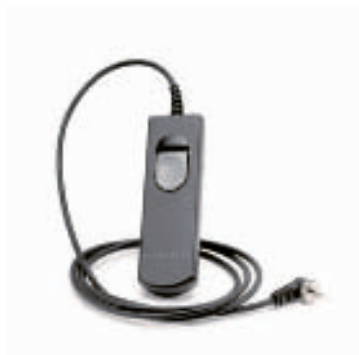
RELEASE CORD XPan II 3054510

The Center Filter XPan ensures the highest corner-to-corner illumination by neutralizing the natural effect of light fall-off that may be apparent in critical applications on transparency film in the panorama format at large aperture settings.