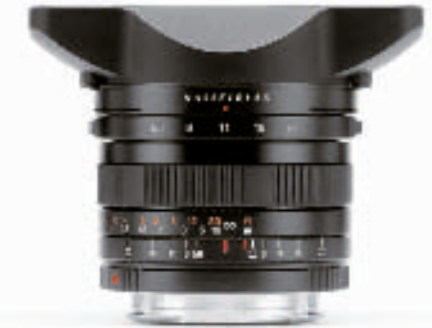
HASSELBLAD 5.6/30 MM ASPHERICAL 3024013

SUPPLIED WITH: VIEWFINDER XPan 30 3054472 VIEWFINDER POUCH XPan 30 3054463 LENS SHADE XPan 30 3054407 CENTER FILTER XPan 30 3054451 FRONT LENS CAP XPan 30 3054410 REAR LENS CAP XPan 3054412 LENS POUCH 1 3058408